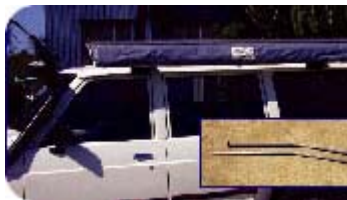
Roof brace stores in bag